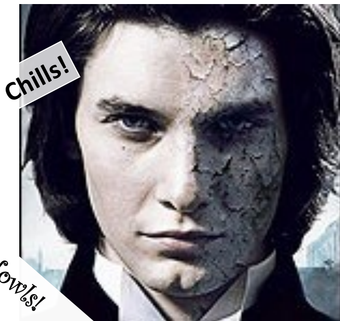
The Picture of Dorian Gray by Oscar Wilde